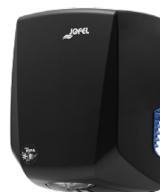
AA56600-MT 8427950367427 Matt black finish