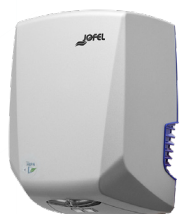
AA56300 8427950367380 Silver finish