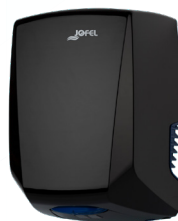
AA56600 8427950367427 Black finish