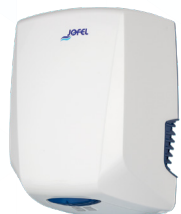
AA56000 8427950367342 White finish