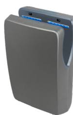
AA24950 8427950360626 Graphite finish