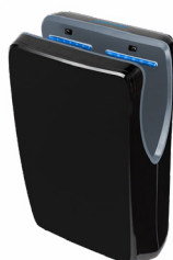
AA24650 8427950360619 Black finish