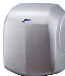
AA18500 8427950340246 Satin finish