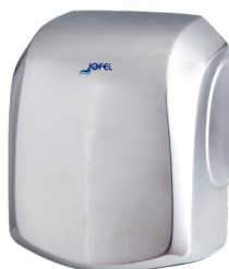
AA18000 8427950340215 Polished finish