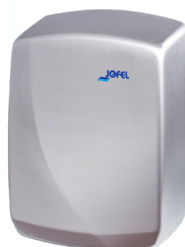
AA16500 8427950304460 Satin finish