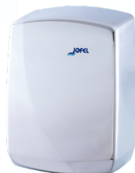
AA16000 8427950304194 Polished finish