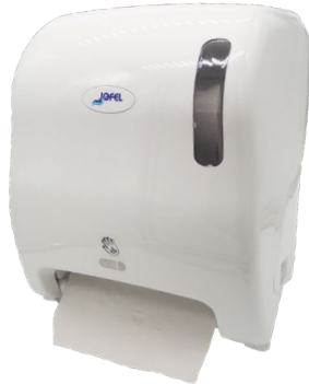
AG65000 8427950382826 White