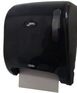
AG65600 8427950388415 Black