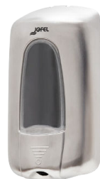
AC74500 8427950375903 Polished stainless steel