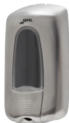
AC74000 8427950375897 Satin stainless steel